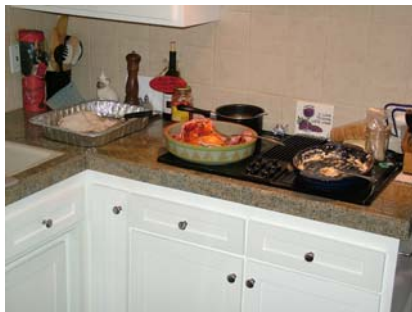
There was plenty of food, plenty of drink, and of course, friends to share it with!