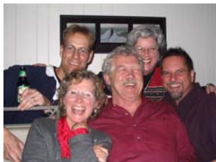
And laughter all around!